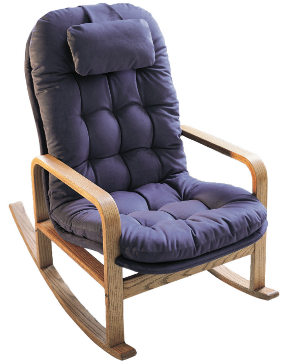
High Back Rocker