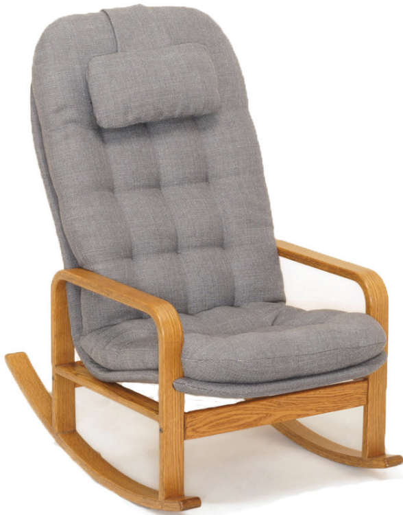
X-High Back Rocker